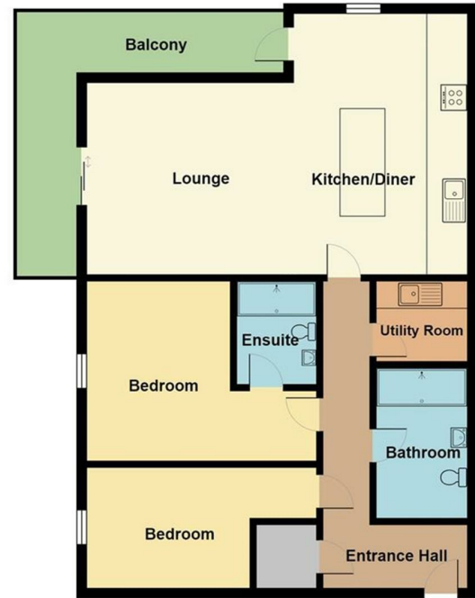
Total Area: 103.7 m 2 ... 1116 ft 2 (excluding balcony) All measurements are approximate and for display purposes only